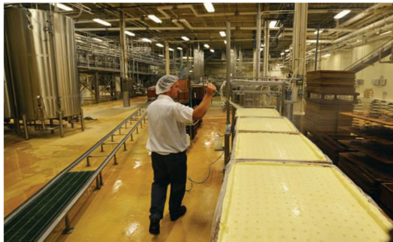
■ A Cheddar room at an Agri-Mark plant. The company has four facilities in Massachusetts, New York and Vermont.

in expanding U.S. dairy exports as a whole. Agri-Mark was one of the founders of the Whey Protein Research Consortium, a precompetitive forum to fund research into whey protein's health benefits.